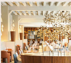
Tasting menu at Epona