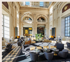
A royal moment at Le Dôme Bar