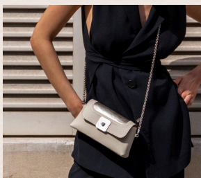
Le sac Lolo Chatenay and InterContinental Lyon