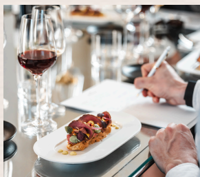
Wine tasting workshop