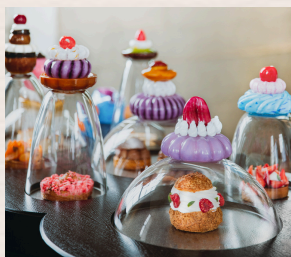
The Intimate Dôme Tea Time

Discover some of our gift ideas to delight the heart of your loved one.